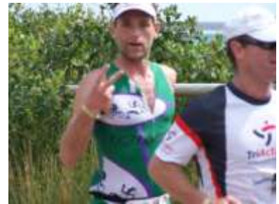
Is this what lap I'm on???